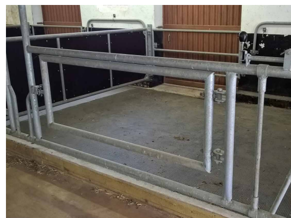
installed VITA with swivelling fixation rack on the Köllitsch experimental farm, Germany