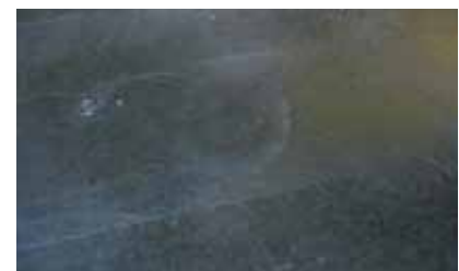
Figure 5: under side of upper mat after continuous tread load

Evaluation scale: ++ / + / o / - / -- (o = standard)