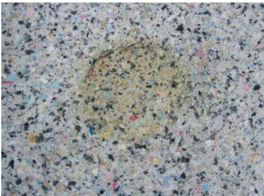
Figure 4: foam after continuous tread load