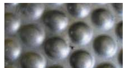
Figure 6: under side of lower mat after continuous tread load